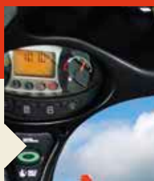
Standard left-hand panel

Monitor the vital functions of the machine, and add another level of security with our Deluxe Instrumentation Panel. The keyless start allows the panel to be locked out to prevent unauthorized starting.