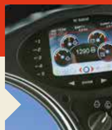
Optional Deluxe right-hand panel